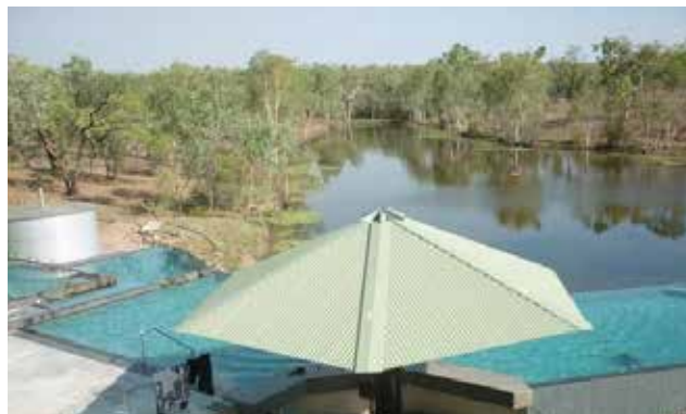
Cobbold Gorge Resort, Cobbold Gorge

We hand pick hotels and resorts based on their location, customer feedback, value and atmosphere. Here's a selection: