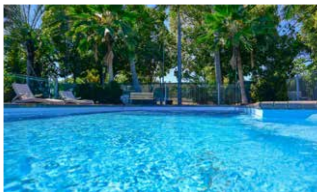
Ash's Holiday Units