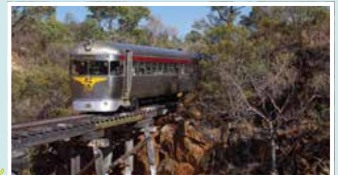
The Bally Hooley Steam Railway