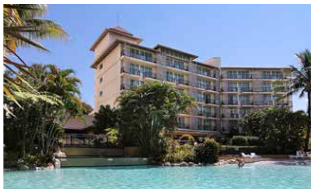
Novotel Oasis Hotel, Cairns