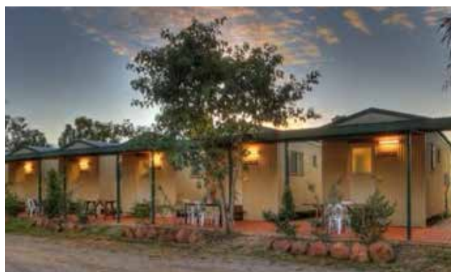
Bedrock Village, Mt Surprise