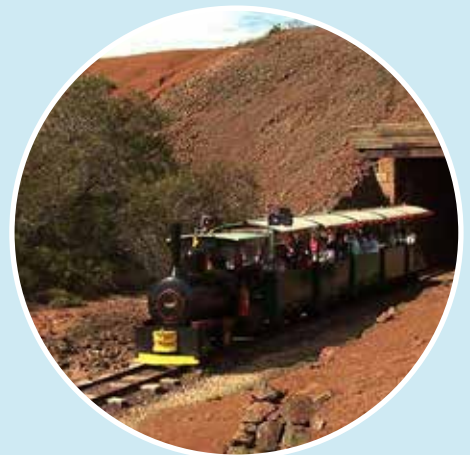
Tourist train Moonta