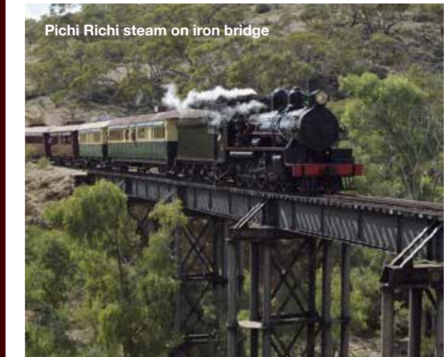
Pichi Richi steam on iron bridge