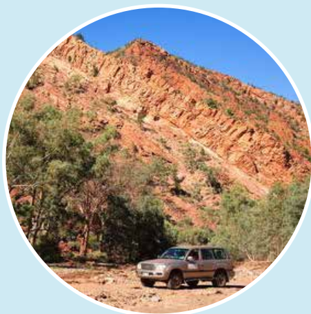
4x4 Tour in the Flinders

The best train trips possible, private luxury coach for off-train travel, guided walking where suitable, and other appropriate and appealing options to make exploration easy.