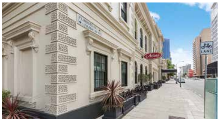
Adina Apartment Hotel, Adelaide