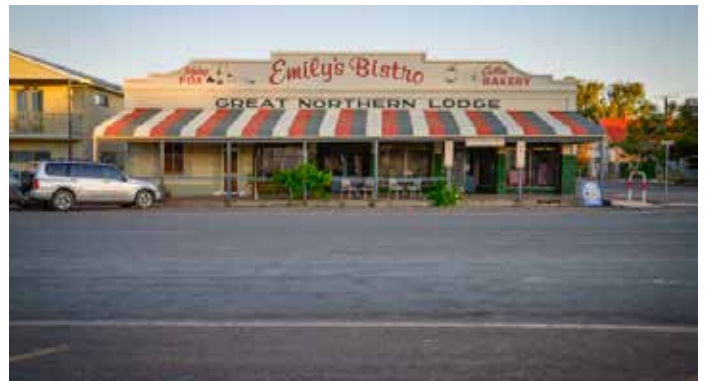
Lodge Hotel Quorn