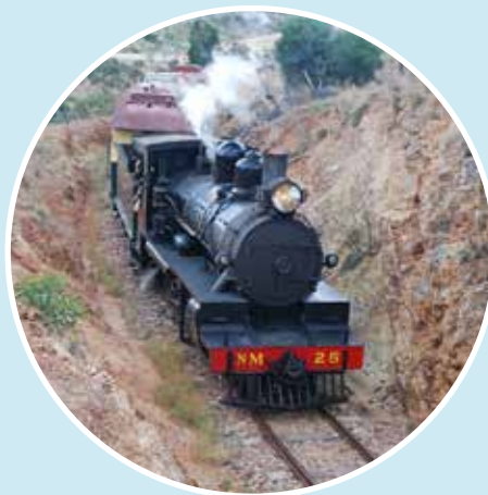
Pichi Richi Explorer