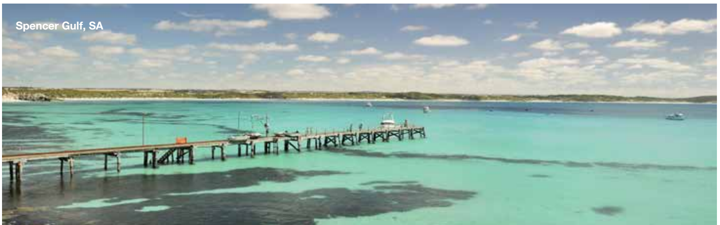
Spencer Gulf, SA