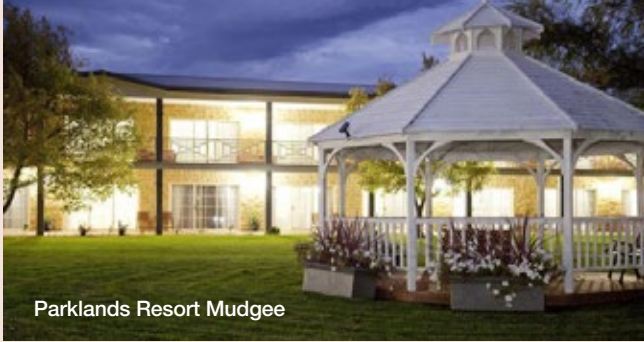
Parklands Resort Mudgee

Final payment due by ..... 10 March 2021