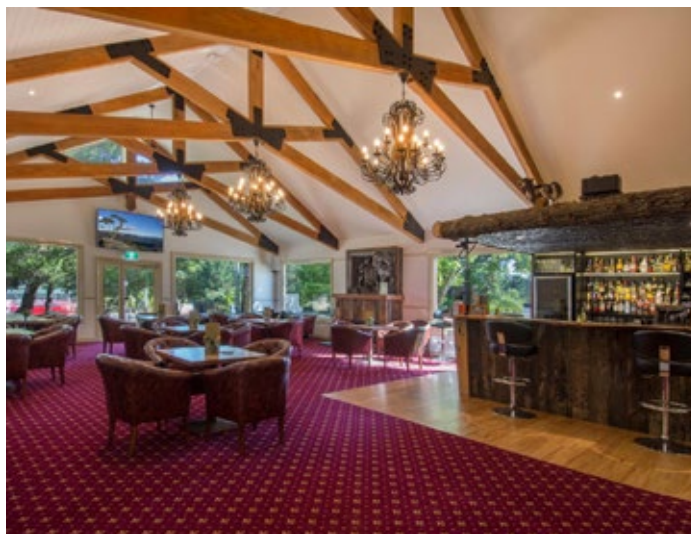
Black Gold Motel, Wallerawang