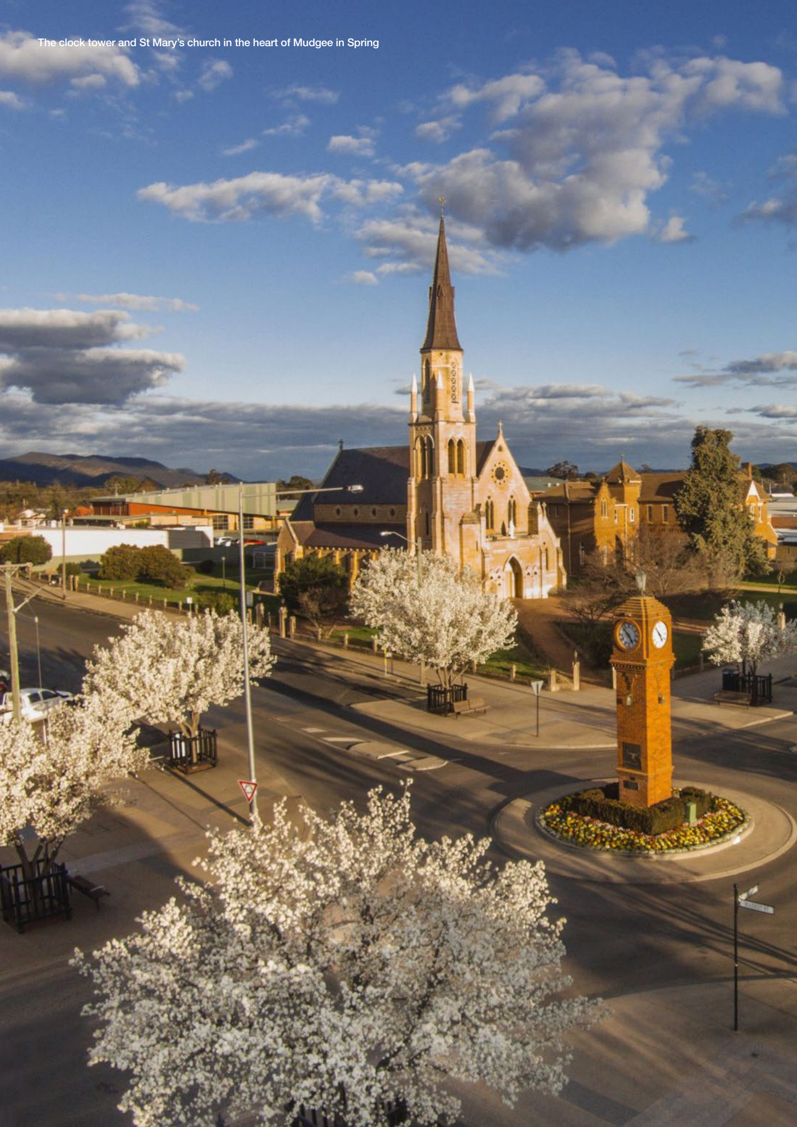
The clock tower and St Mary's church in the heart of Mudgee in Spring