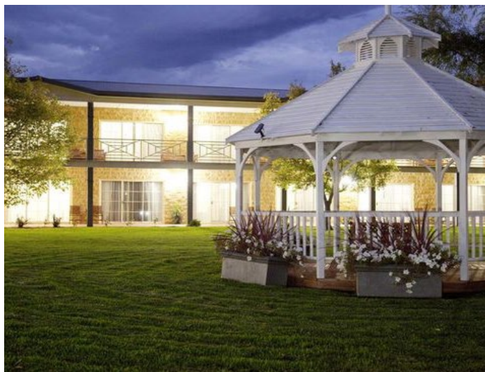
Parklands Resort Mudgee

Hand-picked hotels and resorts based on location, customer feedback, value and atmosphere.