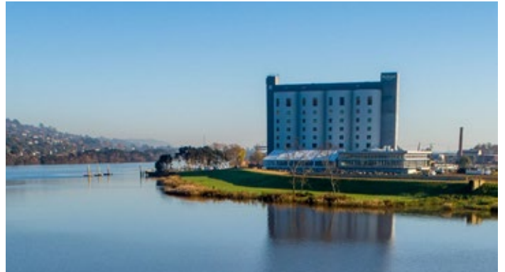
Peppers Silos, Launceston

Hand-picked hotels and resorts based on location, customer feedback, value and atmosphere. Here's a selection: