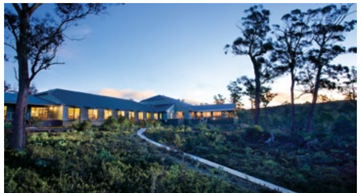
Cradle Mountain Hotel, Cradle Mountain

Please Note: Hotels of a similar standard may be substituted.