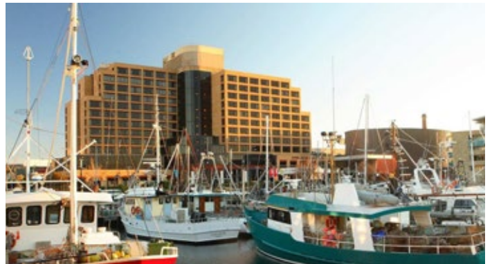
Grand Chancellor, Hobart