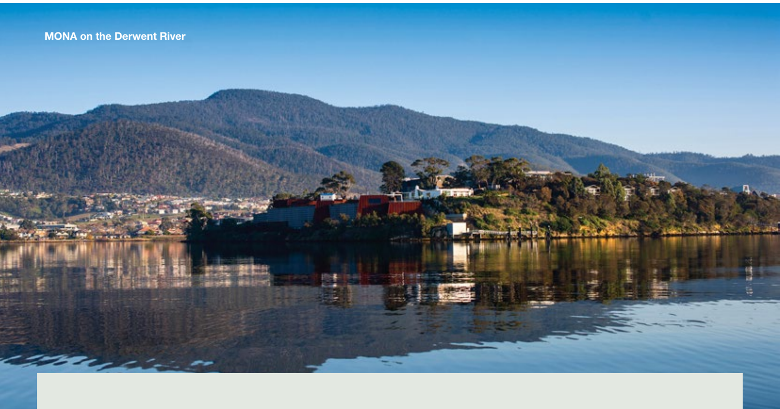
MONA on the Derwent River