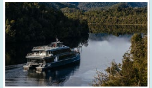
Spirit of the Wild Gordon River

The best train trips possible, private luxury coach for off-train travel and many other appealing modes of transport.