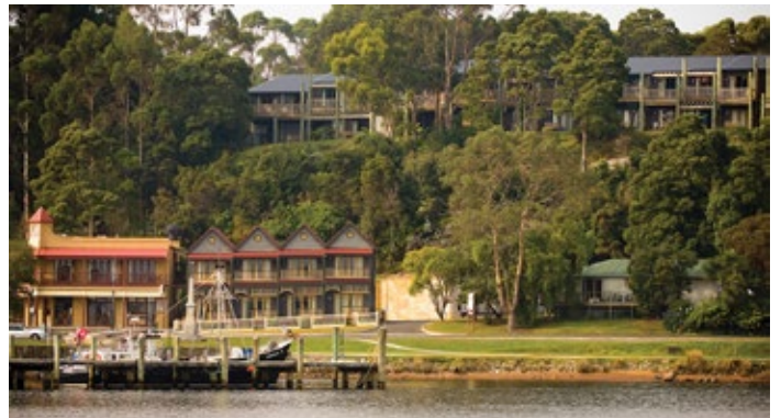
Strahan Village, Strahan