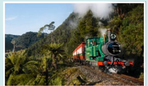
West Coast Wilderness Railway