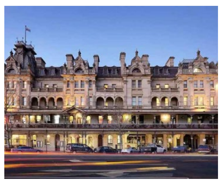
Hotel Shamrock, Bendigo