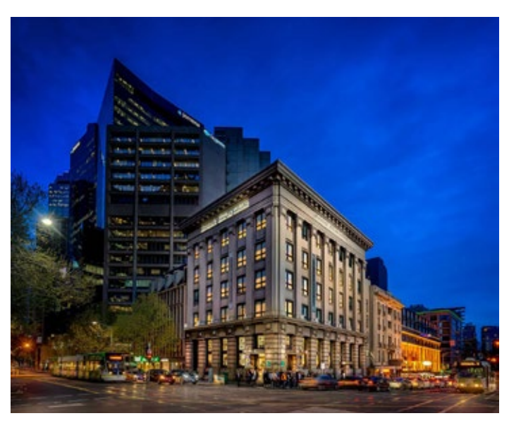
The Batman Hill on Collins, Melbourne

Hand-picked hotels based on location, customer feedback, value and atmosphere. Here's a selection: