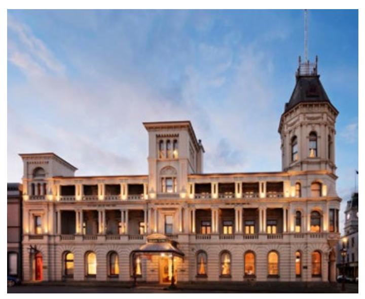
Craig's Royal Hotel, Ballarat