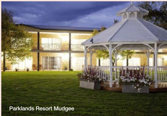
Parklands Resort Mudgee