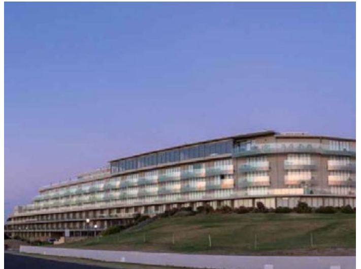
Rydges Mount Panorama, Bathurst

Hand-picked hotels and resorts based on location, customer feedback, value and atmosphere.