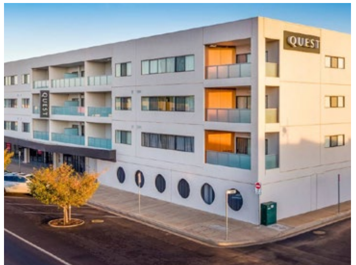
Quest Hotel, Dubbo