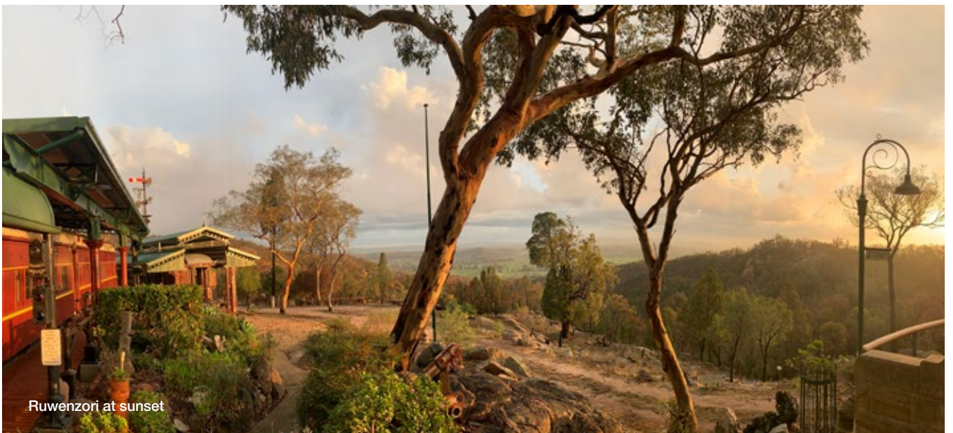
Ruwenzori at sunset