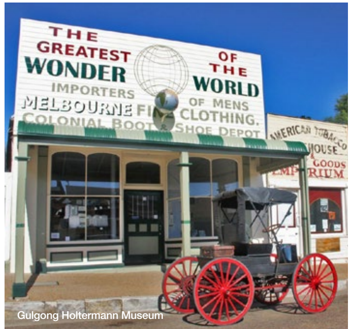
Gulgong Holtermann Museum

You will need to be able to walk for a couple of hours at a gentle pace, remain standing in museums and galleries, get on and off coaches, trains and boats unassisted. These tours often include luggage handling services, short-distance transfers, privately chartered trains and longer stays in hotels so you can more easily choose to take time out.