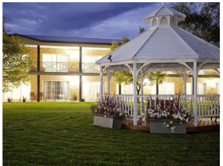
Parklands Resort, Mudgee