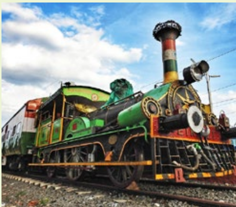
The Fairy Queen

The best train trips possible, private luxury coach for off-train travel, guided walking where suitable, and other appropriate and appealing options to make exploration easy.