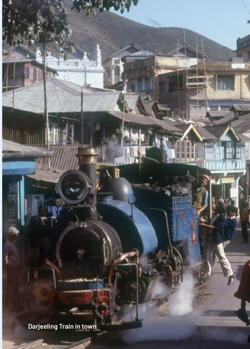
Darjeeling Train in town

On this tour, you will see some of the grand relics of its fascinating rail history and visit some of the most amazing destinations in India, along with World Heritage sites that will take your breath away. The mountain railways of India are UNESCO World Heritage-listed in their own right, only the second railways in the world to be so acclaimed. Your journey will focus on how the British Raj escaped the heat of the plains with their mini-England Hill Stations accessed by quirky little mountain trains. The views are astounding, the culture is rich with history and colour and the trains you'll ride are some of the most celebrated and unique in the world.