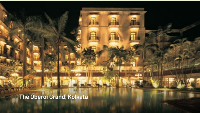
The Oberoi Grand, Kolkata

Please Note: Hotels of a similar standard may be substituted.