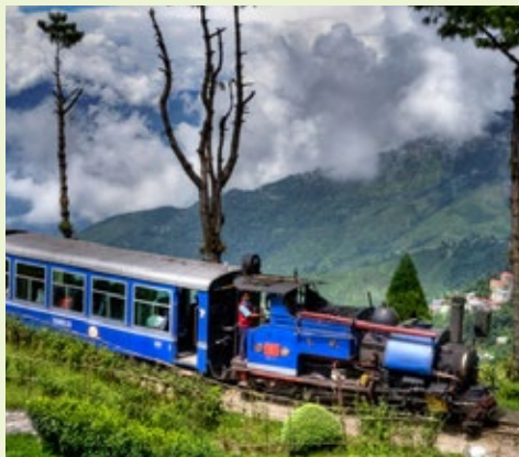
Darjeeling Toy Train