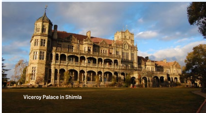
Viceroy Palace in Shimla