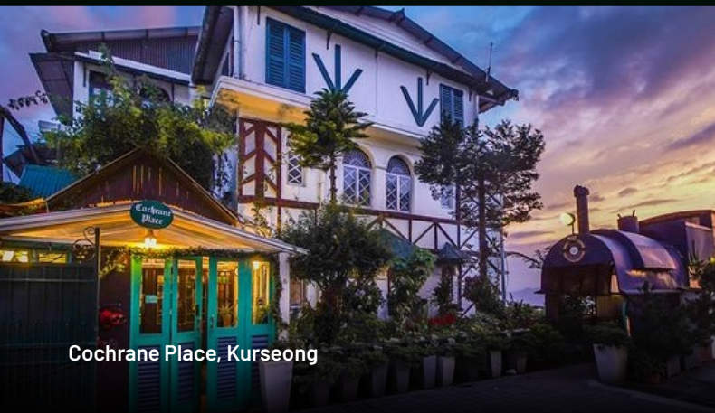
Cochrane Place, Kurseong