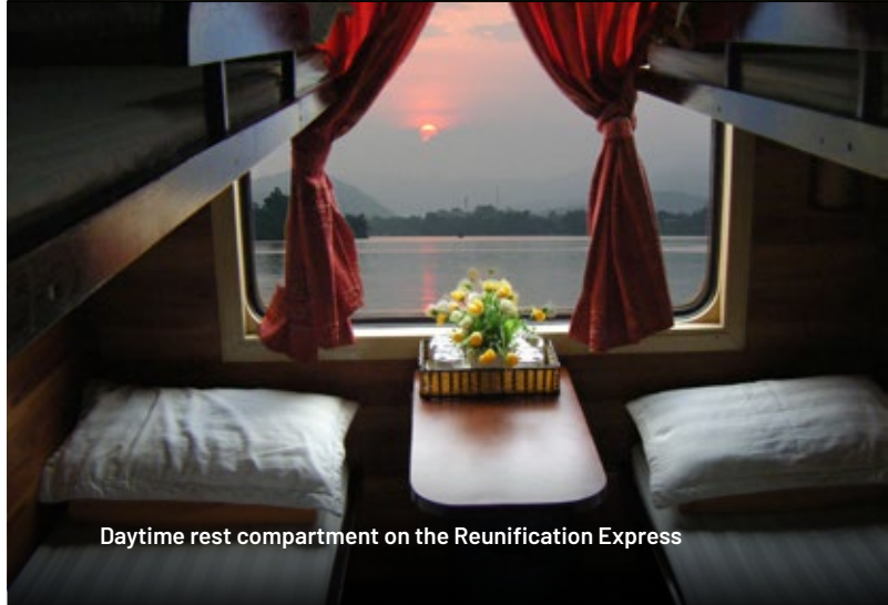
Daytime rest compartment on the Reunification Express