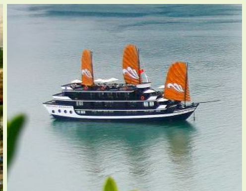
Luxury Private Junk on Halong Bay