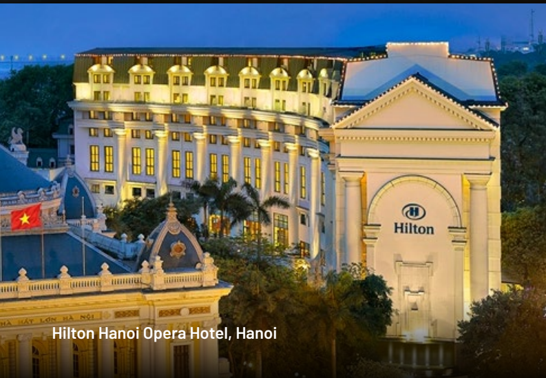
Hilton Hanoi Opera Hotel, Hanoi