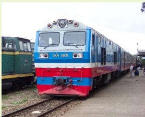
Private carriages on the Reunification Express

The best train trips possible, private luxury coach for off-train travel, guided walking where suitable, and other appropriate and appealing options to make exploration easy.