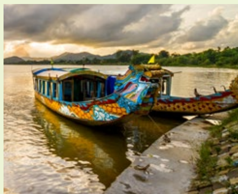
Dragon Boat on the Perfume River at Hue