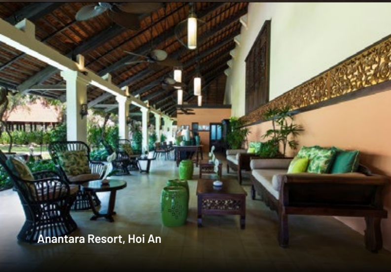
Anantara Resort, Hoi An