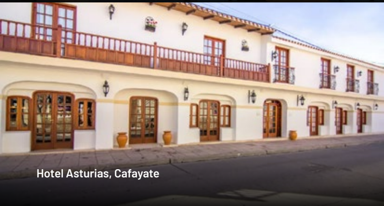
Hotel Asturias, Cafayate