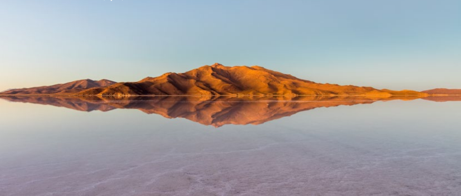
Sunrise reflection on salt flats, Uyuni, Bolivia

With Rail South America, the journey is more important than the destination. While we do visit famous tourist destinations, the attraction is in the journey itself, as well as in the remote regions most travellers have never seen.