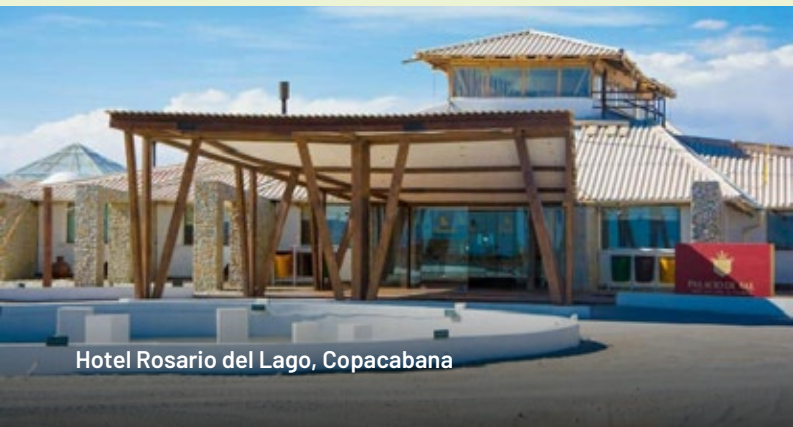
Hotel Rosario del Lago, Copacabana

Please Note: Hotels of a similar standard may be substituted.