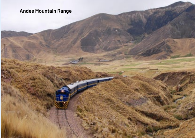
Andes Mountain Range

This South American adventure will take you on a three-week trip from Argentina and through Bolivia, finishing up in Peru. Travel from the iconic city of Buenos Aires to Tucuman and visit the famous wine region of Cafayate. Traverse the country on the iconic 'Tren a las Nubes' and continue the journey through the incredible landscape of the Uyuni Salt Flats to La Paz in Bolivia. In Peru, visit the highest navigable lake in the world, Lake Titicaca, and the UNESCO World Heritage-Listed site of Machu Picchu. This journey will bring you to many of the region's must-see sites, but you'll also explore some rare and fascinating off-the-beaten-track tourist destinations.