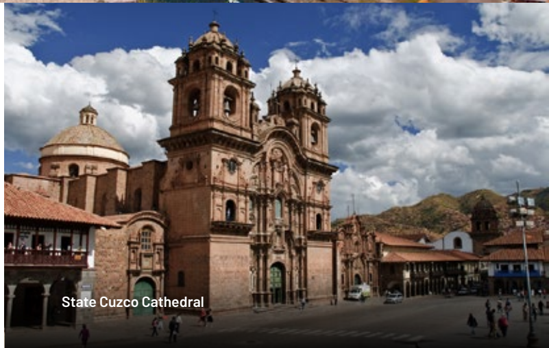
State Cuzco Cathedral

The most common grading for our tours. Two loco itineraries offer many activities that require a little extra fitness – walking on uneven ground, climbing hills to enter towns or historic sites, walks of 1-3 kilometres as well as getting on and off transport. You need to have good mobility and aerobic fitness and be able to manage your own luggage.