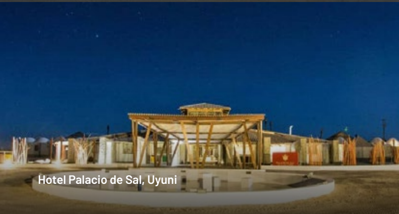
Hotel Palacio de Sal, Uyuni