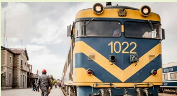
Wara Wara Express, Bolivia