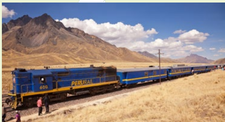
Perurail Titicaca Train, La Raya Peru

The best train trips possible, private luxury coach for off-train travel, guided walking where suitable, and other appropriate and appealing options to make exploration easy.