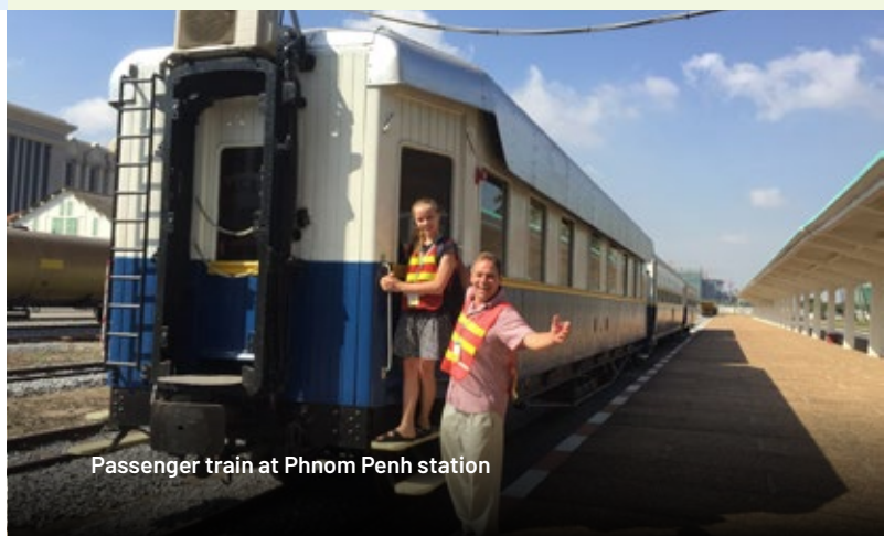
Passenger train at Phnom Penh station