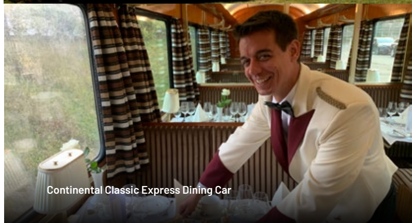
Continental Classic Express Dining Car