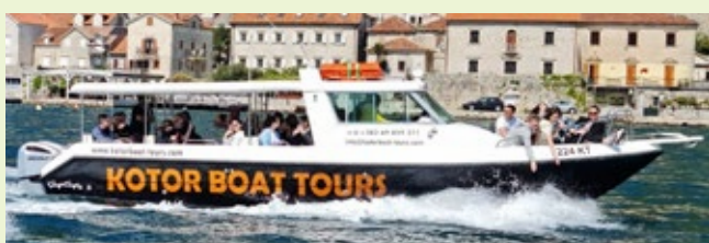
Kotor boat cruise