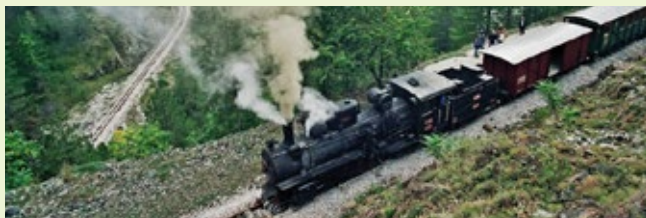
Sargan Eight Railway