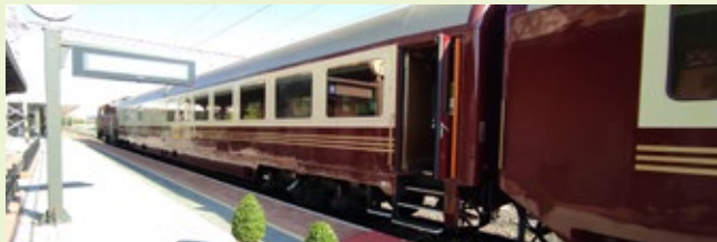
Continental Classic Express Train de Luxe

The best train trips possible, private luxury coach for off-train travel, guided walking where suitable, and other appropriate and appealing options to make exploration easy.