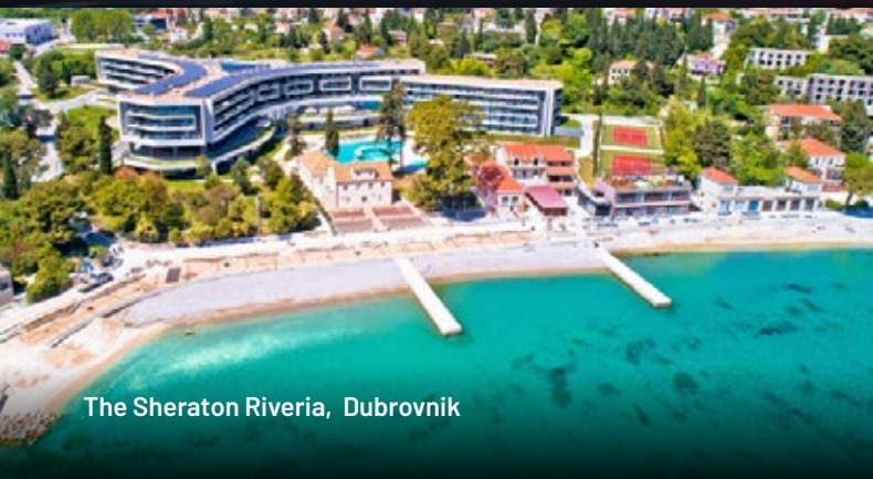
The Sheraton Riveria, Dubrovnik