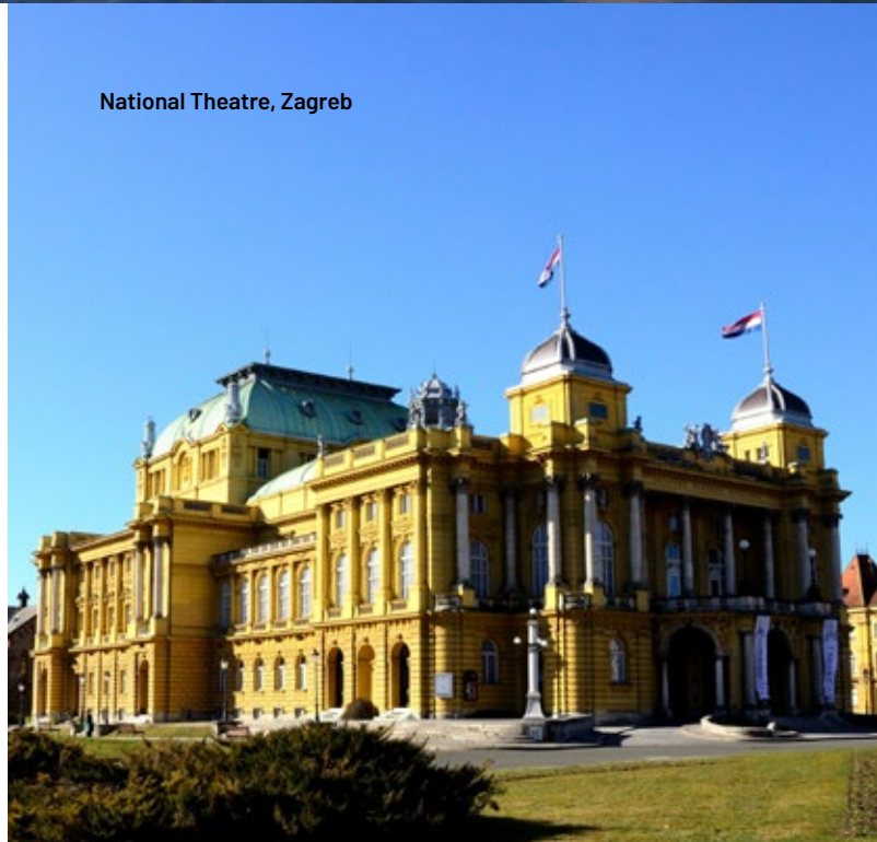
National Theatre, Zagreb

The most common grading for our tours. Two loco itineraries offer many activities that require a little extra fitness – walking on uneven ground, climbing hills to enter towns or historic sites, walks of 1-3 kilometres as well as getting on and off transport. You need to have good mobility and aerobic fitness and be able to manage your own luggage.