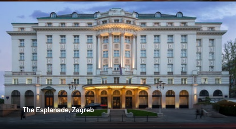
The Esplanade, Zagreb